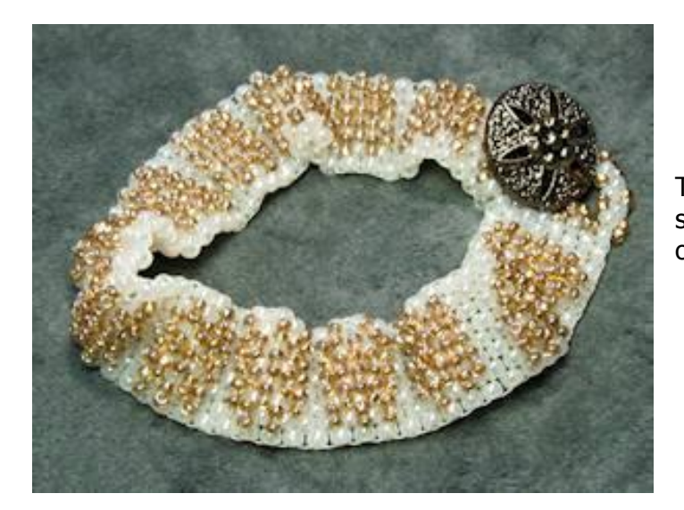
This is a bracelet done with peyote stitches, with a little bead embroidery on top.

Once again, peyote, but this time using triangle beads, as well as magatamas.